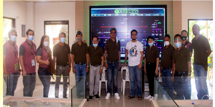
Among these programs and projects are as follows:

ASELCO has established strong connections with various private and public institutions in the implementation of its developmental programs for the local communities and its MCOs, such as the national government agencies, provincial, municipal and barangay local government units.