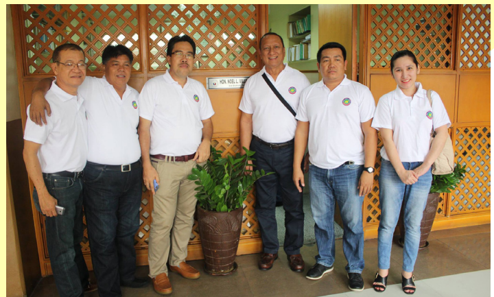
The TARELCO II Board and Management Best practices

From the original 205.039 kilometers of lines energized by TARELCO II, it has now reached 2,608 kilometers in 2019 with a density of 48 consumers for every kilometer of line.